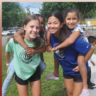
ChristPower Mission Trip participants volunteered at MobileHope in Dayton.

YOUR COMMITMENT IS YOUR FAITH IN ACTION CPLI COMMITMENT TO PARISH LIFE